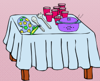
Table services and drinks provided.