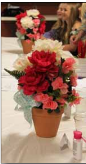
A number of lucky ticket holders got to take home the centerpieces from the Daughters of Isabella Mother-Daughter Brunch.