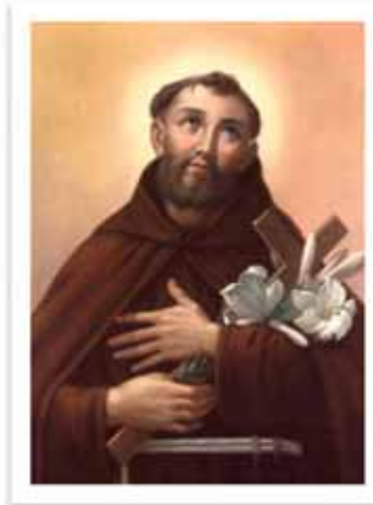
St. Fidelis of Sigmaringen

“My husband and I have a religious difference. He thinks he is God and I don’t.”