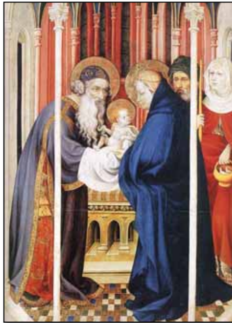
(from the Holy Gospel according to Luke 2:22-40)