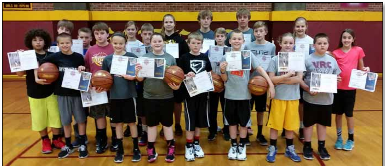
Pictured above are all the participants in the 2017 Knights of Columbus local free throw championship held at Victoria High School gymnasium on Sunday, January 29.

Each of these winners can compete in the district competition to be held on Sunday, February 12 , at the Victoria High School Gymnasium with an eye toward moving on to the regional, state, and international levels.