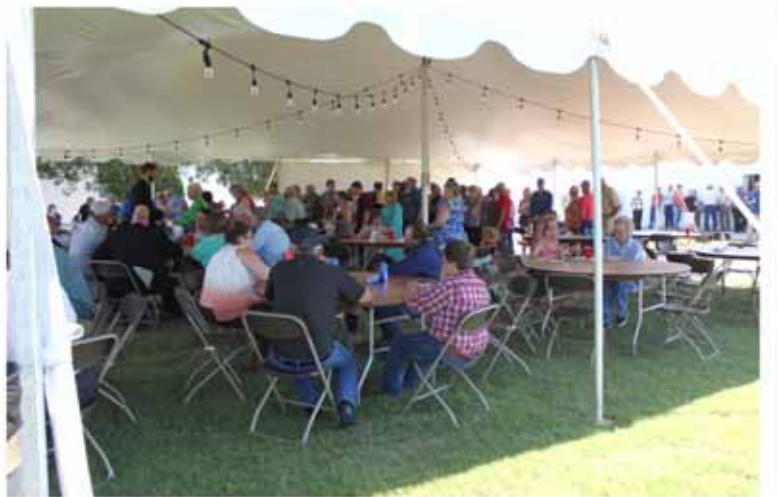
Visitors enjoyed a German meal under a huge tent set up on the north side of the church.