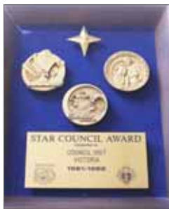
LEFT: Pictured is one of several Star Council Awards Victoria's K. of C. Council 1867 has received over the years.