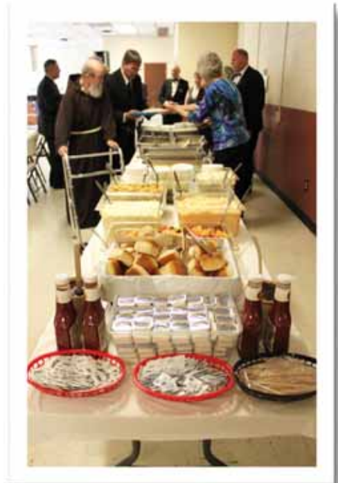
ABOVE: The buffet for the anniversary offered many delicious selections.