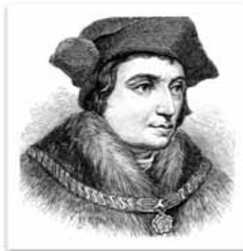
St. Thomas More