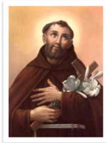
St. Fidelis of Sigmaringen

"My husband and I have a religious difference. He thinks he is God and I don't."