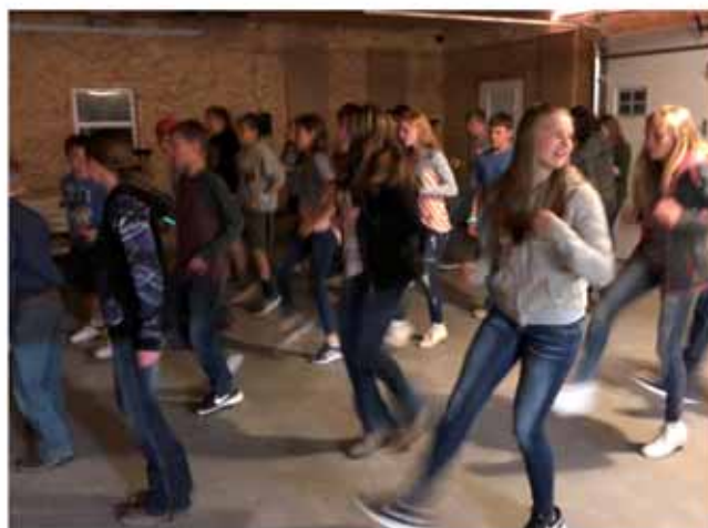
Nearly all 20 kids make their moves on the dance floor at St. Boniface parish hall.