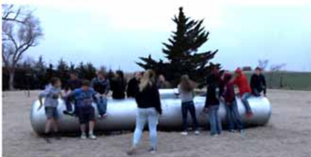
Kids playing Man-hunt on the St. Boniface grounds before the dance, using the propane tank as base.