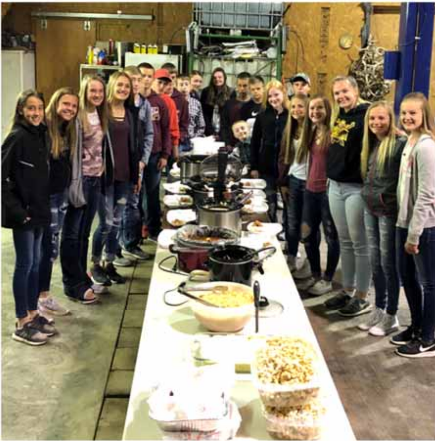
Twenty Jr. CYO kids line up to go through two tables of food at the Jr. CYO end-of-school supper and dance.

PS: When the dance was over we heard the words "Can we do this again?" So looking at the fall calendar, the CYO Back-to-School BBQ and Dance is scheduled at St. Boniface for Saturday, September 22.