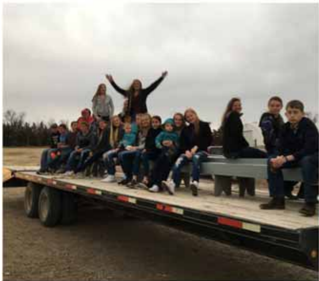
Enjoying the hayride on the way to St. Boniface Church.