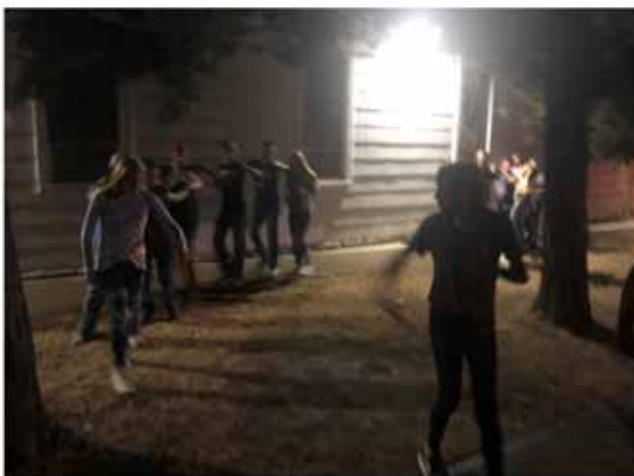
Time to take a "train dance" outside along St. Boniface Church.