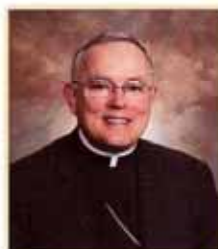
Archbishop Charles Chaput, O.F.M. Cap.