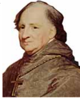
Archbishop John Carroll

We recommend likewise, to your unbounded mercy, all our fellow citizens throughout the United States, that we may be blessed in the knowledge and sanctified in the observance of your most holy law; that we may be preserved in union, and in that peace which the world cannot give; and after enjoying the blessings of this life, be admitted to those which are eternal. Grant this, we beseech you, O Lord of mercy, through Jesus Christ, our Lord and Savior. Amen.