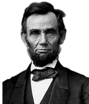
President Abraham Lincoln