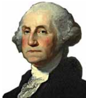
President George Washington