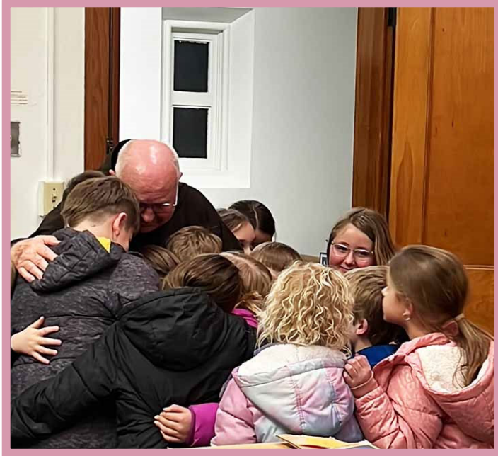
ABOVE: Father and students in a heart-felt group hug.