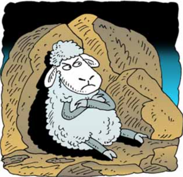
Some sheep do not want to be found

Gospel parables are to puzzle us and inspire a new perspective. This Sunday's story of the persistent widow and the dishonest judge has done just that to many, even scripture experts. We tend to assume that the judge represents God and the widow is a desperate Christian begging God for help. But a dishonest, heartless judge is not a fitting image of a merciful God.